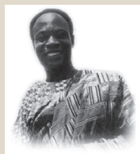
Kwame Nkrumah (1909-72)

First Prime Minister of Ghana (1952-66); led the freedom movement; advocated the causes of socialism and African unity; opposed neo-colonialism; removed in a military coup.