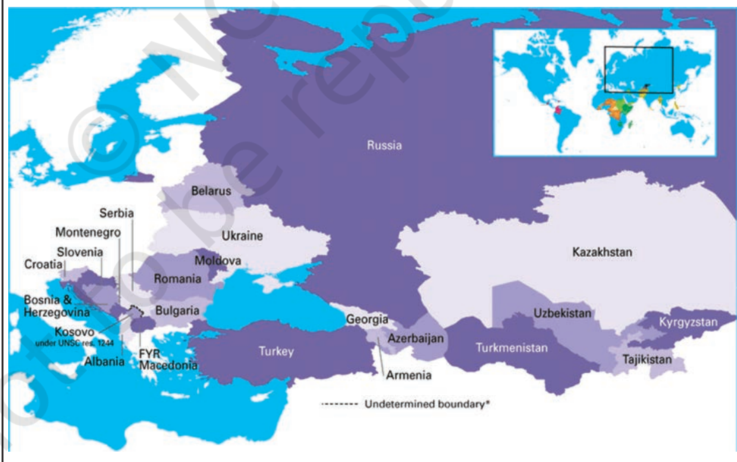
MAP OF CENTRAL, EASTERN EUROPE AND THE COMMONWEALTH OF INDEPENDENT STATES

Locate the Central Asian Republics on the map.