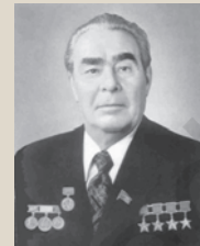
Leonid Brezhnev (1906-82)

Leader of the Soviet Union (1964-82); proposed Asian Collective Security system; associated with the détente phase in relations with the US; involved in suppressing a popular rebellion in Czechoslovakia and in invading Afghanistan.