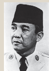
Sukarno (1901-70) First President of Indonesia (1945-65); led the freedom struggle; espoused the causes of socialism and anti-imperialism; organised the Bandung Conference; overthrown in a military coup.