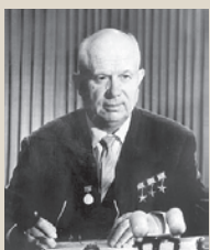
Nikita Khrushchev (1894-1971)

Leader of the Soviet Union (1953-64); denounced Stalin's leadership style and introduced some reforms in 1956; suggested "peaceful coexistence" with the West; involved in suppressing popular rebellion in Hungary and in the Cuban missile crisis.