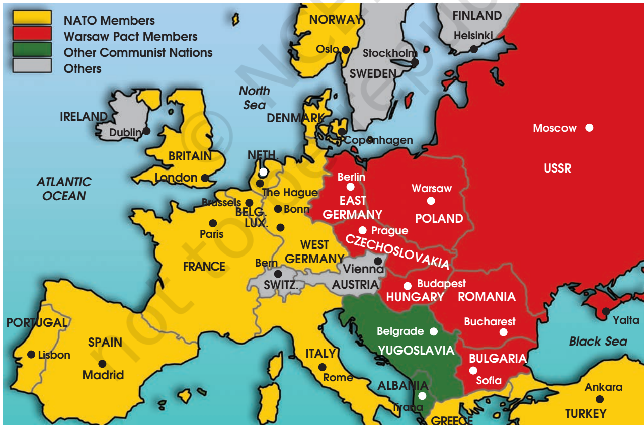
Map showing the way Europe was divided into rival alliances during the Cold War

3. By comparing this map with that of the European Union map, identify three new countries that came up in the post-Cold War period.