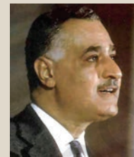
Gamal Abdel Nasser (1918-70) Ruled Egypt from 1952 to 1970; espoused the causes of Arab nationalism, socialism and anti-imperialism; nationalised the Suez Canal, leading to an international conflict in 1956.