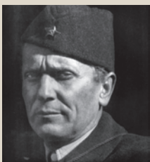
Josip Broz Tito (1892-1980) President of Yugoslavia (1945-80); fought against Germany in World War II; communist; maintained some distance from the Soviet Union; forged unity in Yugoslavia.