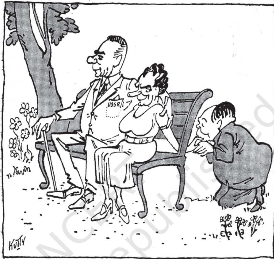
POLITICAL SPRING China makes overtures to the USA.

Drawn by well-known Indian cartoonist Kutty, these two cartoons depict an Indian view of the Cold War. The first cartoon was drawn when the US entered into a secret understanding with China, keeping the USSR in the dark. Find out more about the characters in the cartoon. The second cartoon depicts the American misadventure in Vietnam. Find out more about the Vietnam War.