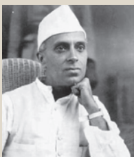
Jawaharlal Nehru (1889-1964) First Prime Minister of India (1947-64); made efforts for Asian unity, decolonisation, nuclear disarmament; advocated peaceful coexistence for securing world peace.

In time, therefore, the US and USSR decided to collaborate in limiting or eliminating certain kinds of nuclear and non-nuclear weapons. A stable balance of weapons, they decided, could be maintained through 'arms control'. Starting in the 1960s, the two sides signed three significant agreements within a decade. These were the Limited Test Ban Treaty, Nuclear Non-Proliferation Treaty and the Anti-Ballistic Missile Treaty. Thereafter, the superpowers held several rounds of arms limitation talks and signed several more treaties to limit their arms.